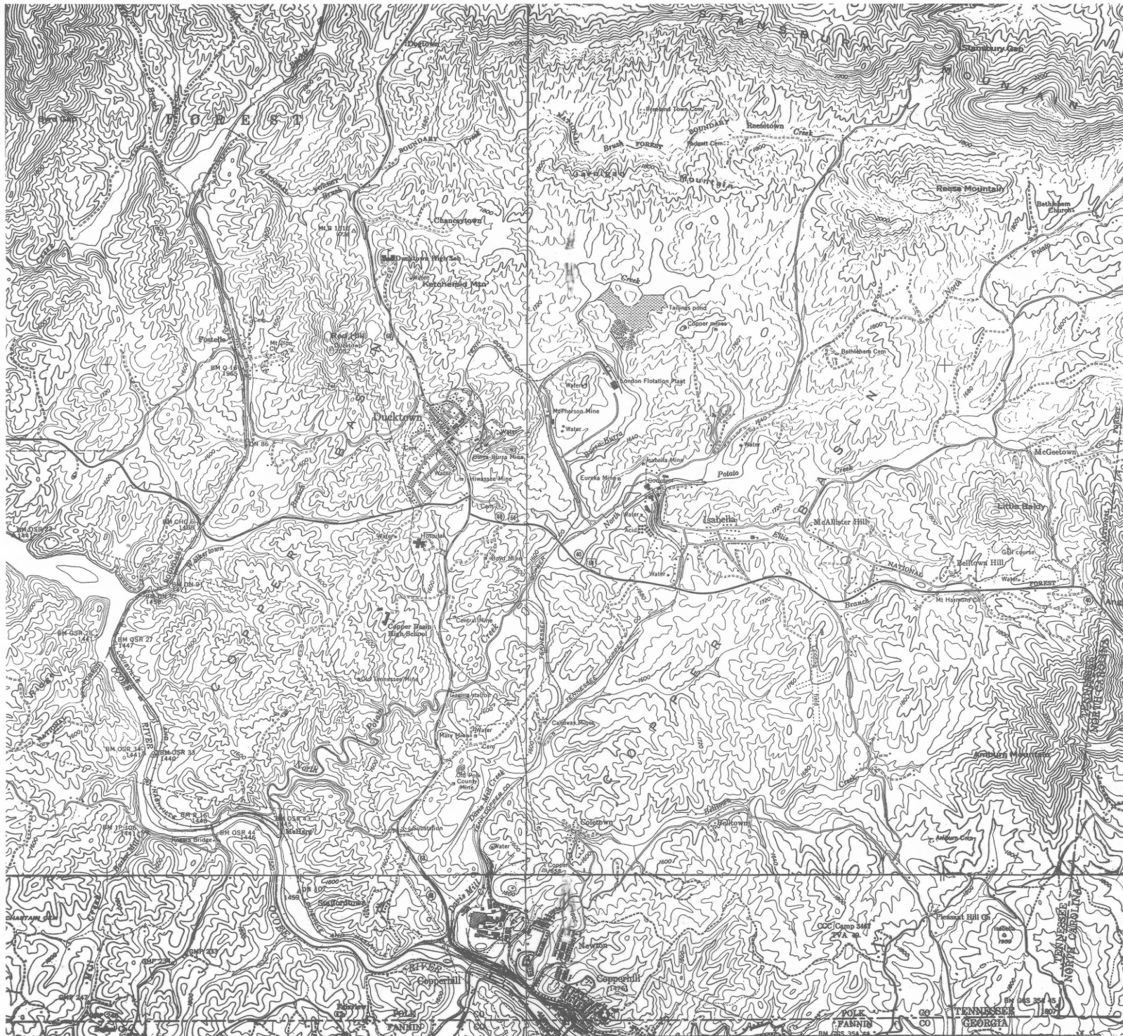
Figure 1. Topographic map of the Copper Basin area (scale 1 inch = 4,000 feet).