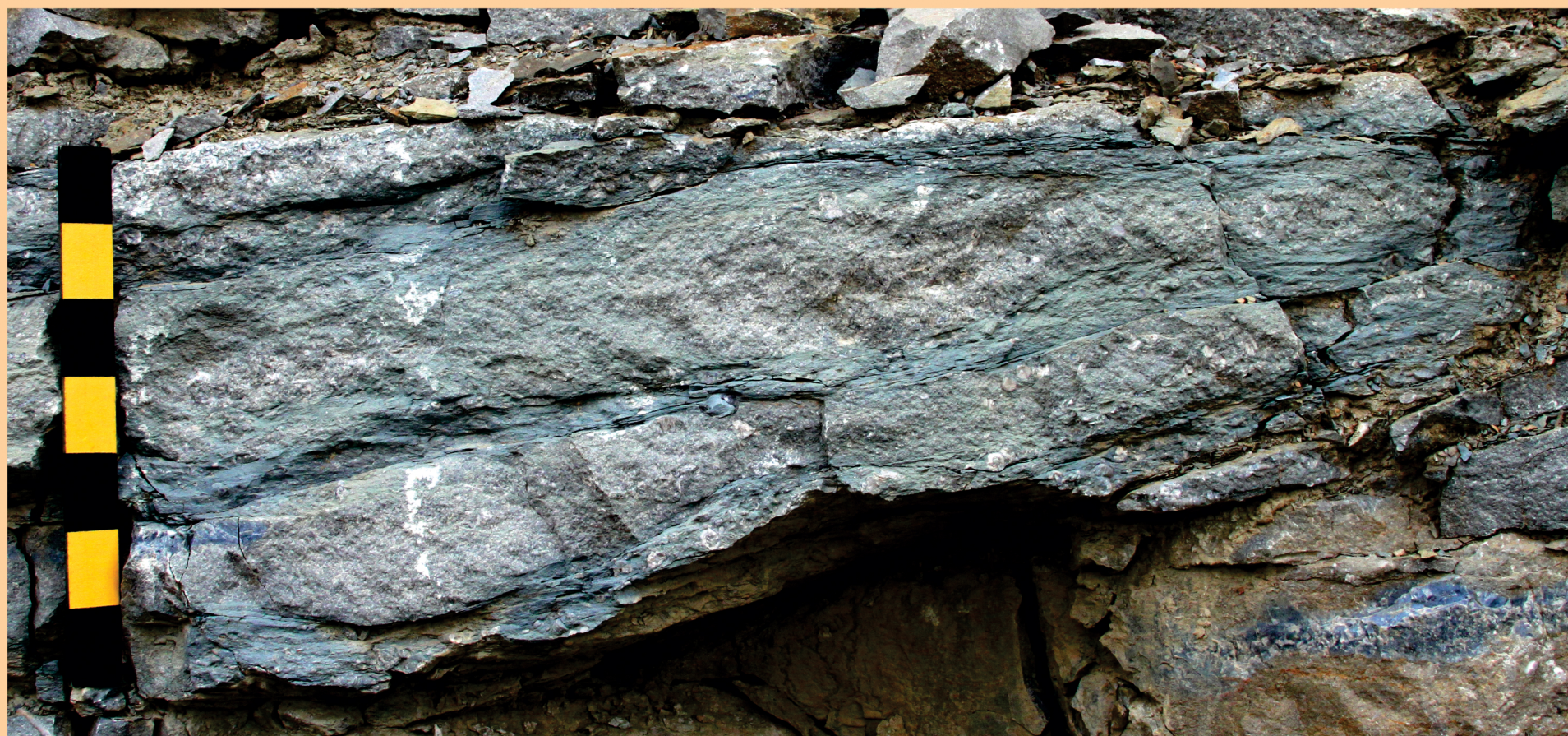
Photo 1 (above). Interbedded crinoid grainstone and siliciclastic mudstone containing dispersed crinoid grains. Observe the variable contacts between main lithologic units: sharp as well as intertonguing. Furthermore note the horizontal change in the mudstone units from predominantly mudstone to intertonguing mudstone and crinoid grainstone. The scale divisions are 5 cm.