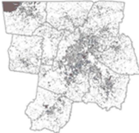
Today's Development Pattern (1,700,000 People)