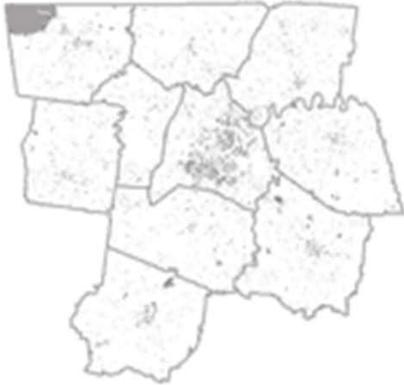
Approx. 1965 Development Pattern (750,000 People)