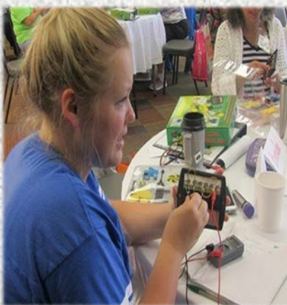
Building a Solar Cell