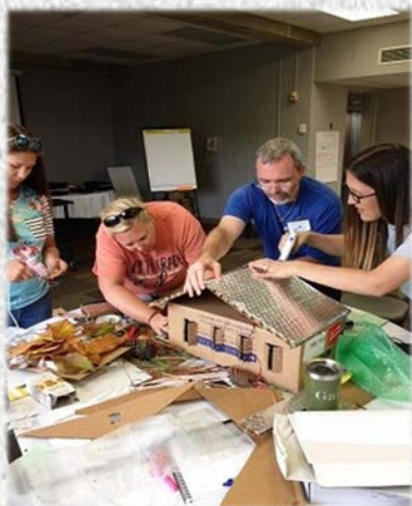
Building Solar Houses

*Energy Camps are offered free of charge on a first-come, first-served basis