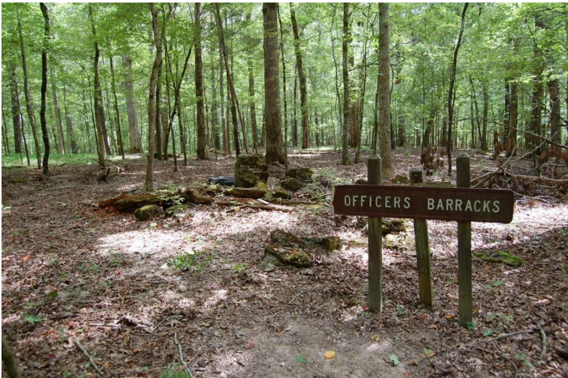
Ruins of the Officer’s Barracks at Montgomery Bell’s Civilian Conservation Corps camp.