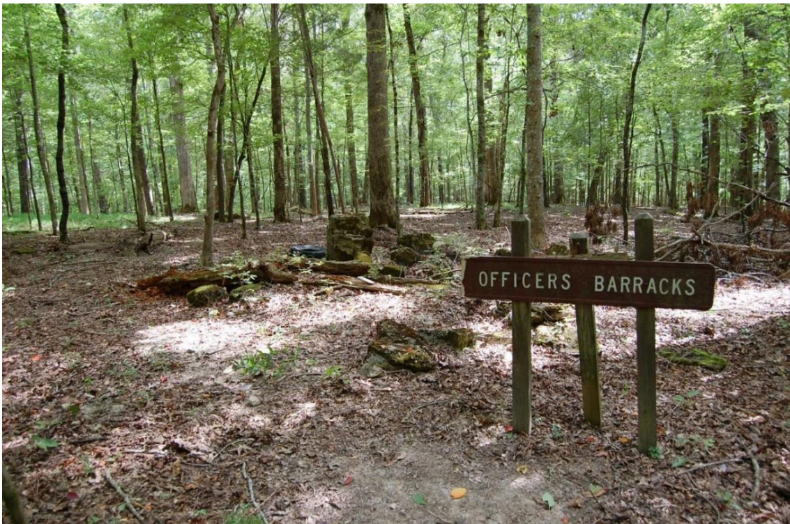
Ruins of the Officer’s Barracks at Montgomery Bell’s Civilian Conservation Corps camp.