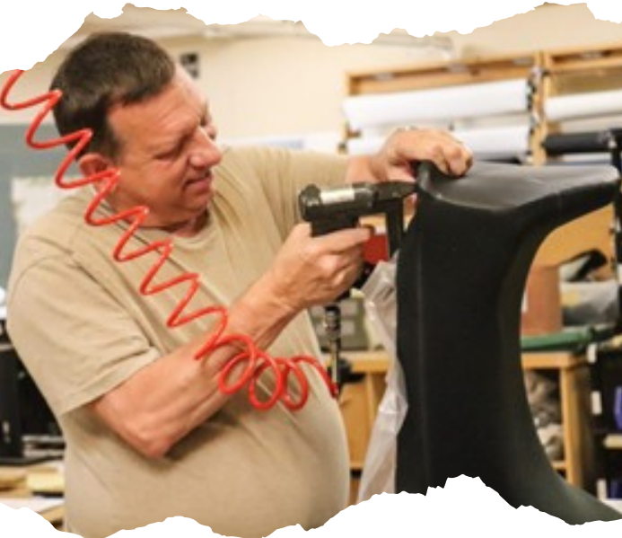
Manufacturing staff in Nashville covers a custom molded cushion.

Each clinic has an associated manufacturing shop where staff with extensive experience in the areas of construction, carpentry, upholstery, and electronics, fabricate equipment to meet individualized needs.