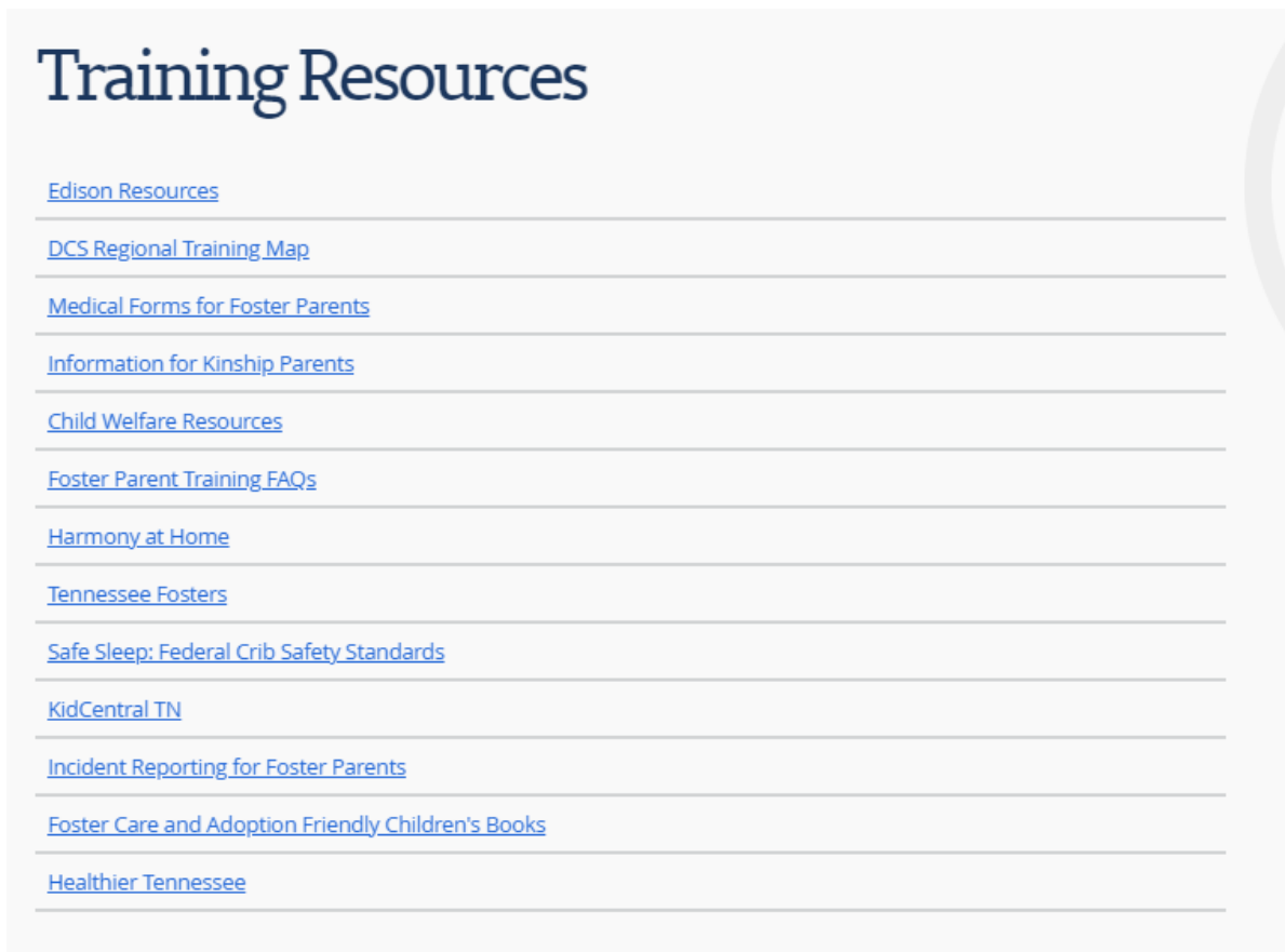
Foster Parent Training Resources