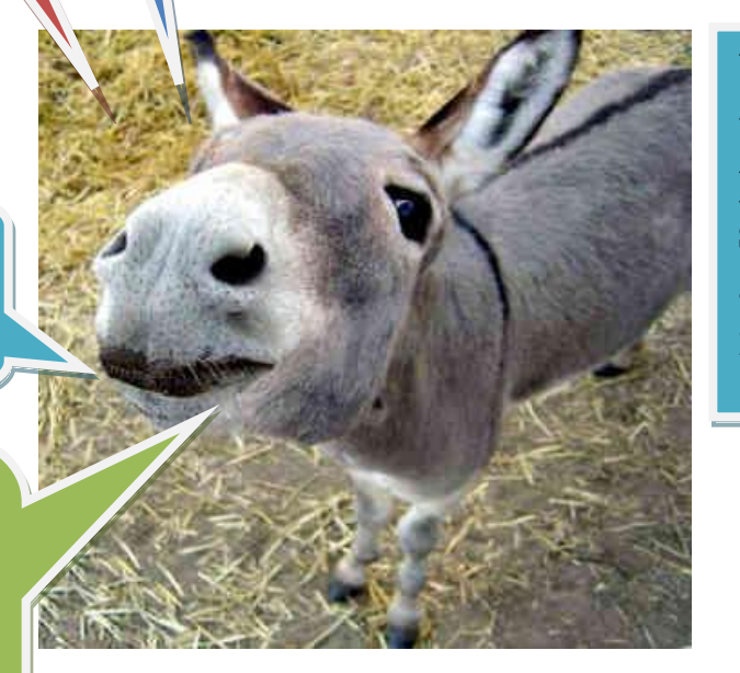
Don't be this guy!