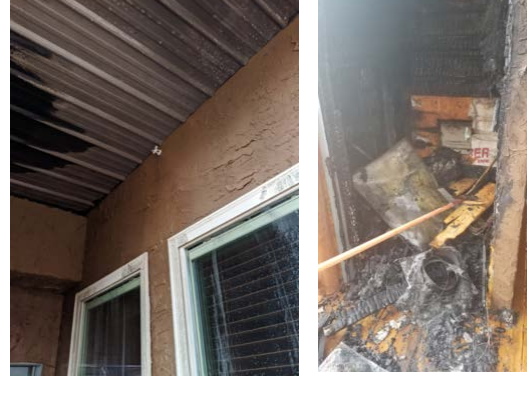
Codes Success Story: In November 2019, a sprinkler activation at a cabin in Pigeon Forge helped limit damage at a $1.2 million property to just $15,000.