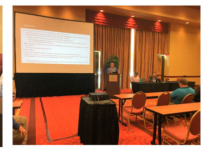
speaks about the latest options in 9-1-1 technology.