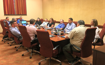
The Operations Committee met to AT&T, S Junity Licitensie discuss the possibility of a mobile PSAP for the state.