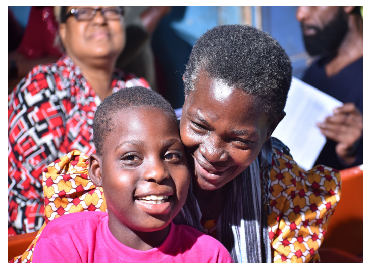
A parent event offered a sense of hope and community to families who were gathering together for the first time.

As I sat at the front table, looking out at the crowd, my mind traveled back to that dark NICU room 11 years ago. I couldn't have dreamed that the path from there would lead to East Africa, to a room full of families finding hope and community. When I stood to speak, the message that poured out of me was one of shared purpose - of finding that together, our path forward is one of joy.