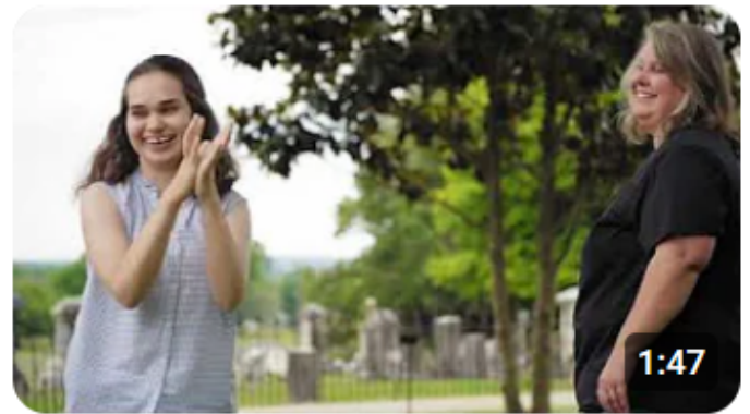
What is developmental disability?