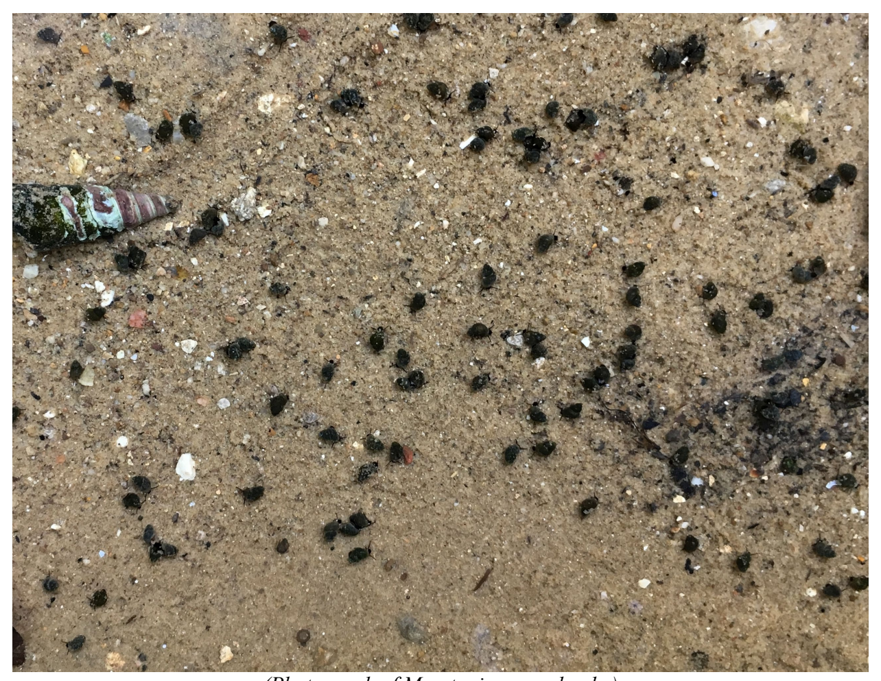
(Photograph of Marstonia ogmorhaphe)

include lower portions of Owen Spring Branch. Any notable changes in these populations will be monitored and reported by TDEC and partner agencies.