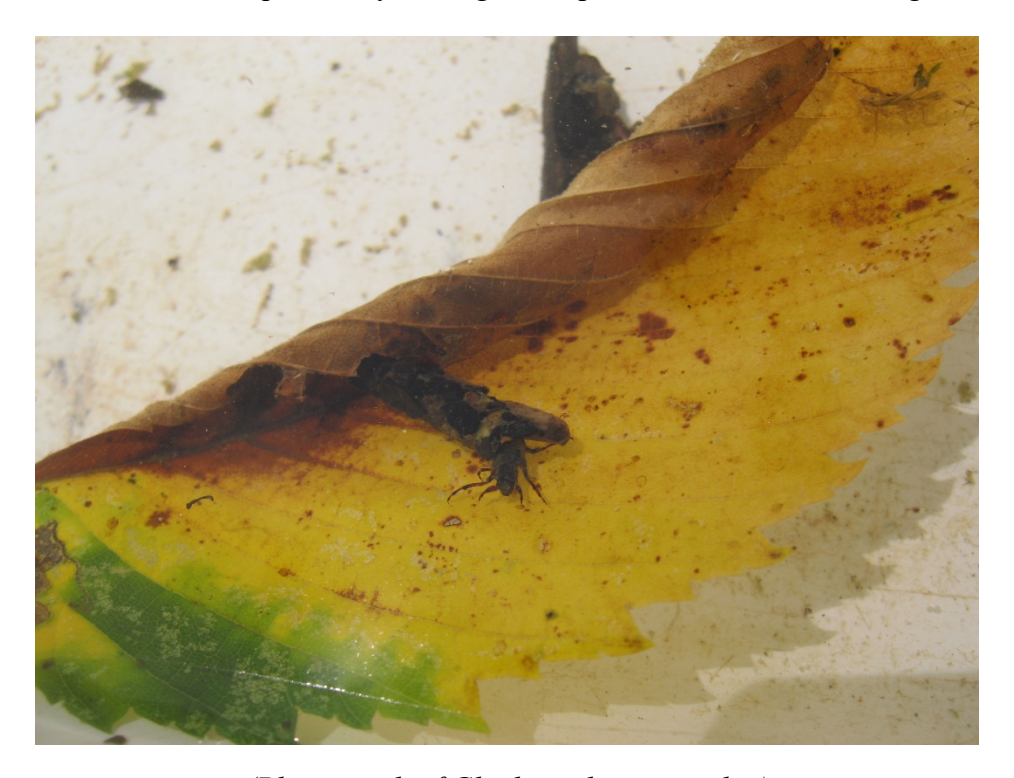
(Photograph of Glyphosyche sequatchie)

Sequatchie residents have a long memory and great appreciation for the cave and natural area, with many fondly recalling days of summer picnics and ice cold watermelons. With full implementation of this 319 project, the SNA will become more welcoming to visitors new and old, striking a balance between preservation of our natural resources and the recreation needs of the local community. We look forward to helping visitors further appreciate Sequatchie Cave State Natural Area for its unique beauty, biological importance, and historical significance.