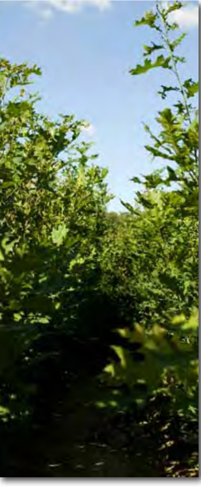
Figure 3. Seedlings growing at the East Tennessee nursery in Delano, Tennessee.