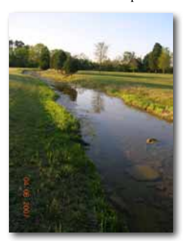
Figure 8. – Stream in need of a forested riparian buffer.

Strategies are being implemented to identify landowners who, through planting forested riparian buffers, will ensure these watersheds continue to produce clean, abundant water for public use (figure 8).