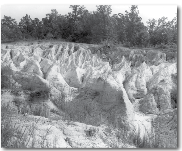
Figure 1. Example from the mid 20th century of extensive gullies in West Tennessee

Since the 1950's, the Division of Forestry's reforestation program has produced over 1 billion tree seedlings. These seedlings have been used to drive rural economic activity and address conservation issues from Mountain City to Memphis. Ongoing investments in programs, land, infrastructure, genetics, and technology have positioned the Division to continue helping landowners meet soil, timber, wildlife, aesthetic and water quality objectives and to help support a multibillion dollar forest products industry. The resulting economic and environmental benefits to Tennesseans are incalculable.