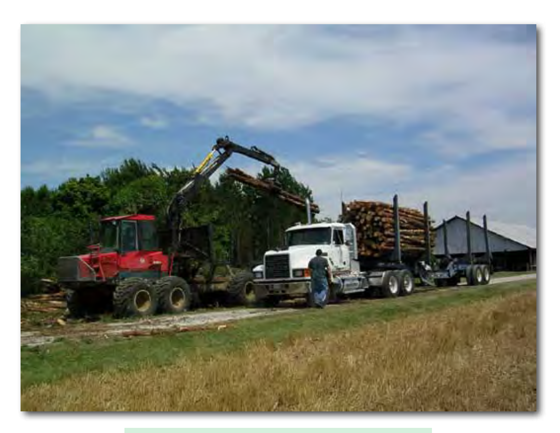
Figure 5. The Division of Forestry's nursery produces enough pine seedlings to reforest 11,000 acres. This represents over $22 million in current dollars to landowners at final harvest.

From a timber perspective, landowners that plant Division of Forestry pine seedlings today receive a 25% gain in productivity as compared to seedlings available 30 years ago. Tennessee's tree improvement program is expected to continue achieving a 1-2% annual gain in pine volume production for the next decade or longer. As a result, landowners planting Division of Forestry pine seedlings 10 years from now can potentially receive an additional $200 or more per acre at final harvest than they would today.