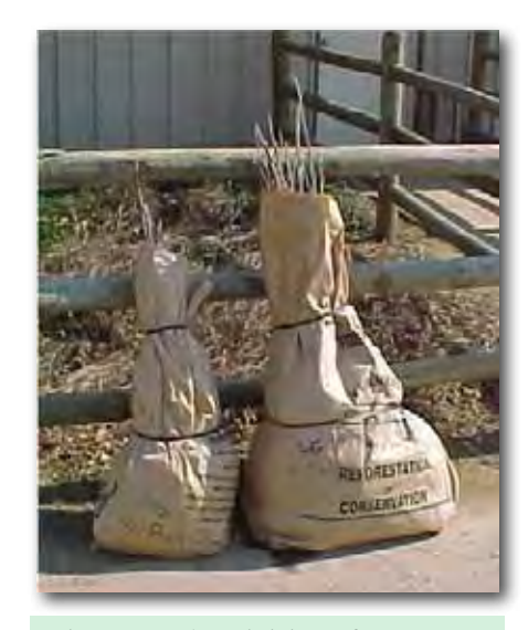
Figure 9. The Division of Forestry's nursery operations can custom grow seedlings to meet specific needs.

Other examples of tailored markets include the production of larger size bareroot hardwood seedlings for use in wetlands mitigation projects and other reforestation efforts of the Tennessee Wildlife Resources Agency and the Tennessee Stream Mitigation Program (figure 9). Similarly, larger seedlings are produced for use in supplemental plantings in several southeastern national forests. Another example of a specialized service provided by the Division of Forestry is the development of adapted seed sources for various non-timber species used in riparian and wildlife buffer plantings and the production of seedlings for this purpose. The Division's nursery personnel have also worked closely with representatives of the Office of Surface Mines to produce seedlings needed for mine reclamation plantings under the Appalachian Regional Reforestation Initiative. Further examples of tailored services include developing specialized seed sources and seedlings for the production of loblolly pine sawtimber and white and Virginia pine Christmas trees in Tennessee.