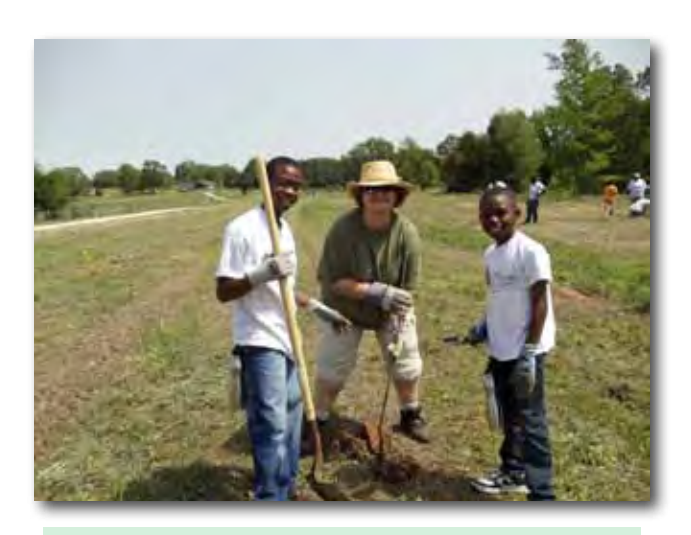
Figure 10. Division of Forestry seedlings being used in the Tennessee Wildlife Federation's Great Outdoors University to demonstrate forest conservation to Memphis elementary school students.

University and other forestry professionals routinely use the Division of Forestry's nursery to conduct research critical to forestry in the southern U.S. Researchers from the University of Tennessee, Auburn University and U.S. Forest Service have all made use of the East Tennessee Nursery to test various theoretical hypotheses. Screening studies conducted under the auspices of the Southern Forest Nursery Management Cooperative have been used to obtain data that may lead to registration of new pesticides for use in forest tree nurseries. Seedlings have been produced at the East Tennessee Nursery for several studies that may one day contribute to the development of a blight resistant American chestnut tree. These research efforts provide information that help nursery and forest managers do a better job of managing Tennessee's forest resource.