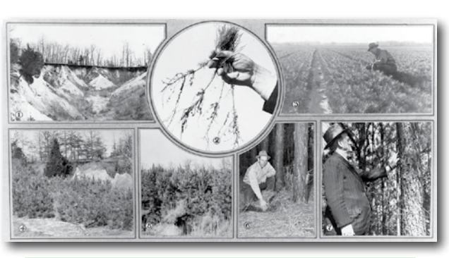
Figure 2. The process of implementing State Forester J.O. Hazard's vision of "erasing gullies from Tennessee's landscape".