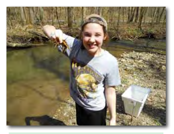
Figure 6. Forests provide "non-traditional" benefits such as clean water and a place to catch crawdads.

Tennessee's Forest Action Plan (FAP) documents the importance of these non-traditional forest benefits and identifies the threats that can potentially decrease the ability of our state's forests to sustain such benefits. More specifically, Tennessee's FAP emphasizes the role forested watersheds play in protecting, maintaining and enhancing public use water supplies. The FAP identified several public supply watersheds as having the highest priority in the state to receive professional forest management assistance (figure 7). These watersheds are greater than 50% forested, face significant threat to development and provide most of the public water supply for at least one water intake. Therefore, these watersheds depend on healthy forests and riparian buffers for quality water yield.