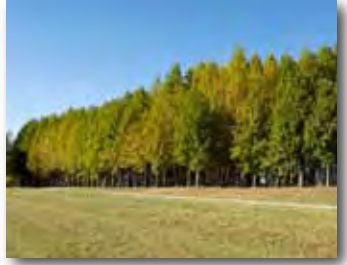
Figure 4. The Division of Forestry's tree improvement operations.

genetically-improved material developed through their combined efforts. This valuable material is used to establish seed production orchards and the resulting genetic gains are passed on to landowners as fast-growing, disease resistant seedlings.