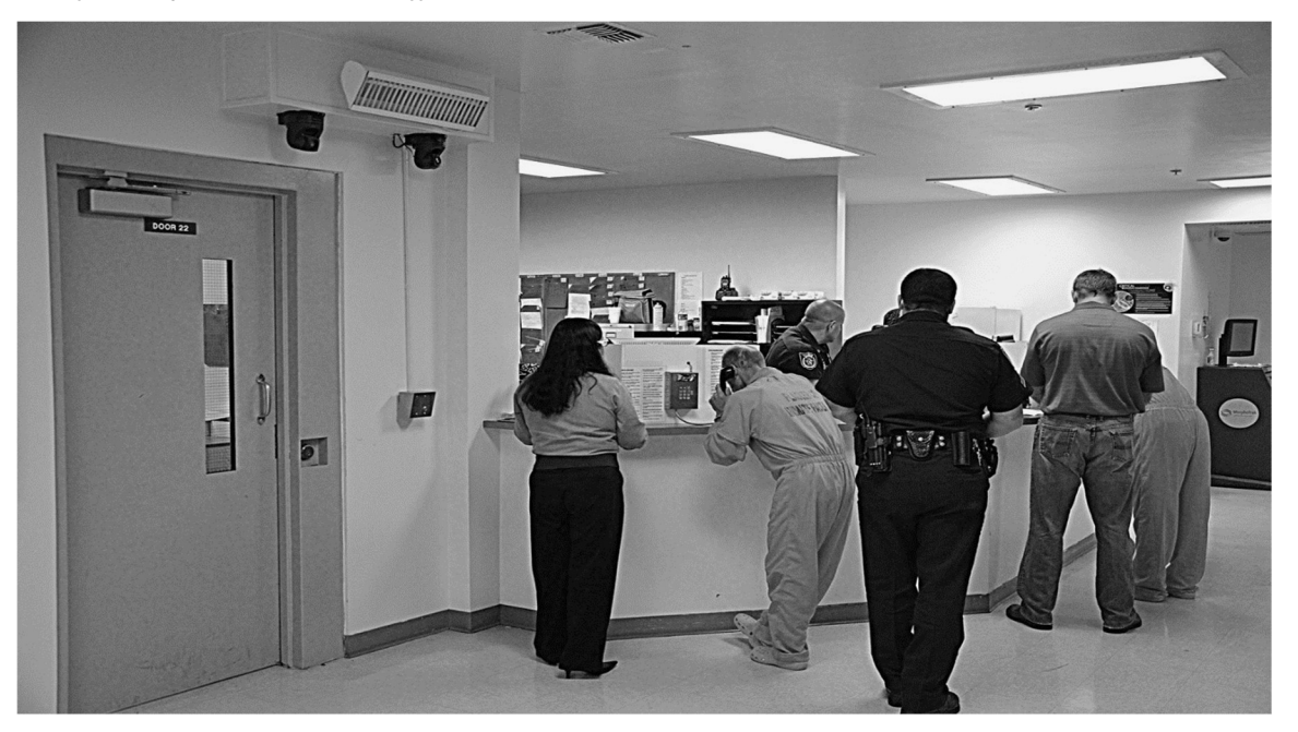
.14 – Admission, Records and Release

Authority: T.C.A. § 41-4-140. Administrative History: Original rule filed August 9, 1982; effective September 8, 1982. Repeal and new rule filed June 29, 1984; effective September 11, 1984. Amendment filed July 31, 2000; effective November 28, 2000. Repeal and new rule filed October 29, 2014; effective January 27, 2015. Amendment filed September 1, 2017; effective November 30, 2017