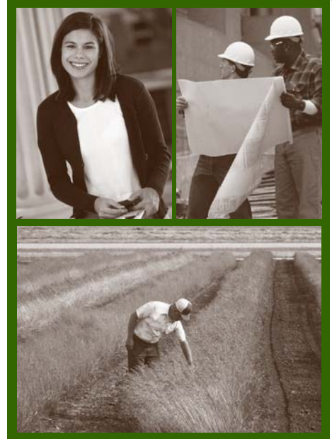
High Growth Industries 2008-2018 in LWIA 9

A new addition to this publication is the Green Jobs information located on the third page. These are the largest occupations in this part of the state that have job responsibilities in the areas of energy efficiency, environmental protection, clean fuels and other innovative practices. It was collected over the past year from a survey conducted by TDLWD.