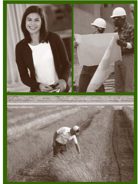
High Growth Industries 2008-2018 in LWIA 13

A new addition to this publication is the Green Jobs information located on the third page. These are the largest occupations in this part of the state that have job responsibilities in the areas of energy efficiency, environmental protection, clean fuels and other innovative practices. It was collected over the past year from a survey conducted by TDLWD.