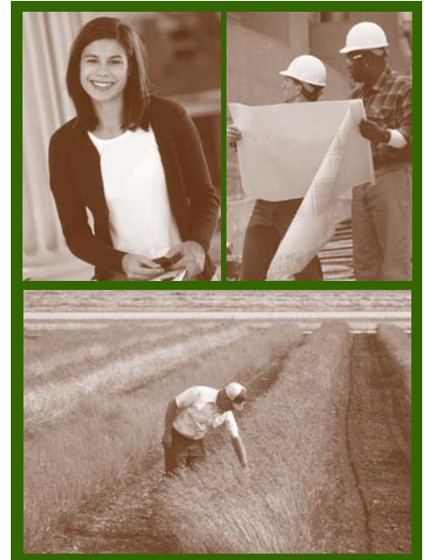
High Growth Industries 2008-2018 in LWIA 1

A new addition to this publication is the Green Jobs information located on the third page. These are the largest occupations in this part of the state that have job responsibilities in the areas of energy efficiency, environmental protection, clean fuels and other innovative practices. It was collected over the past year from a survey conducted by TDLWD.