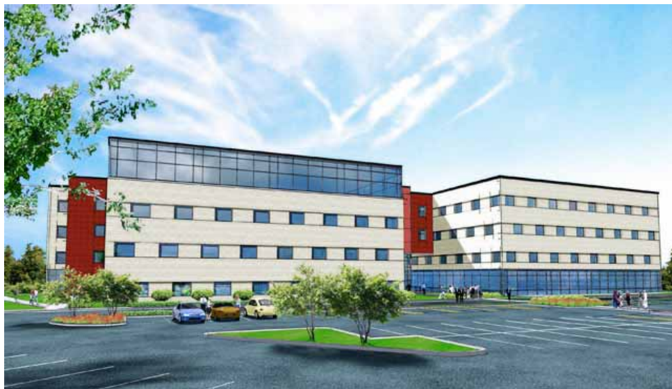
Above is a rendering of the new building that will house the TDLWD. Drawing courtesy Southeast Venture

A NEWSLETTER FOR EMPLOYEES OF THE TENNESSEE DEPARTMENT OF LABOR & WORKFORCE DEVELOPMENT