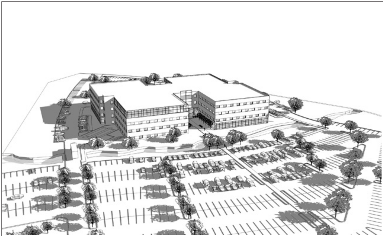
Aerial view of new TDLWD building. Drawing courtesy of Southeast Venture