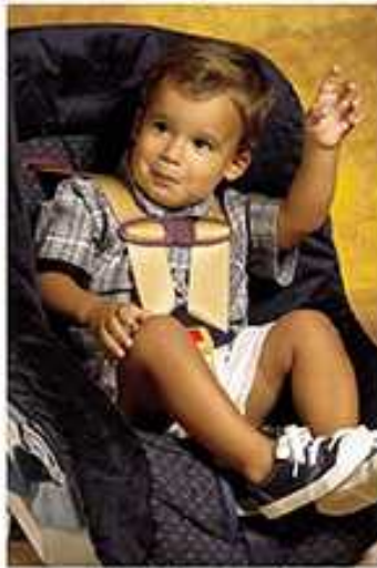
Front-facing Safety Seat