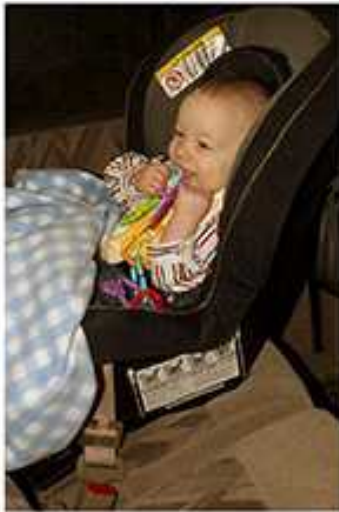
Rear-facing Safety Seat