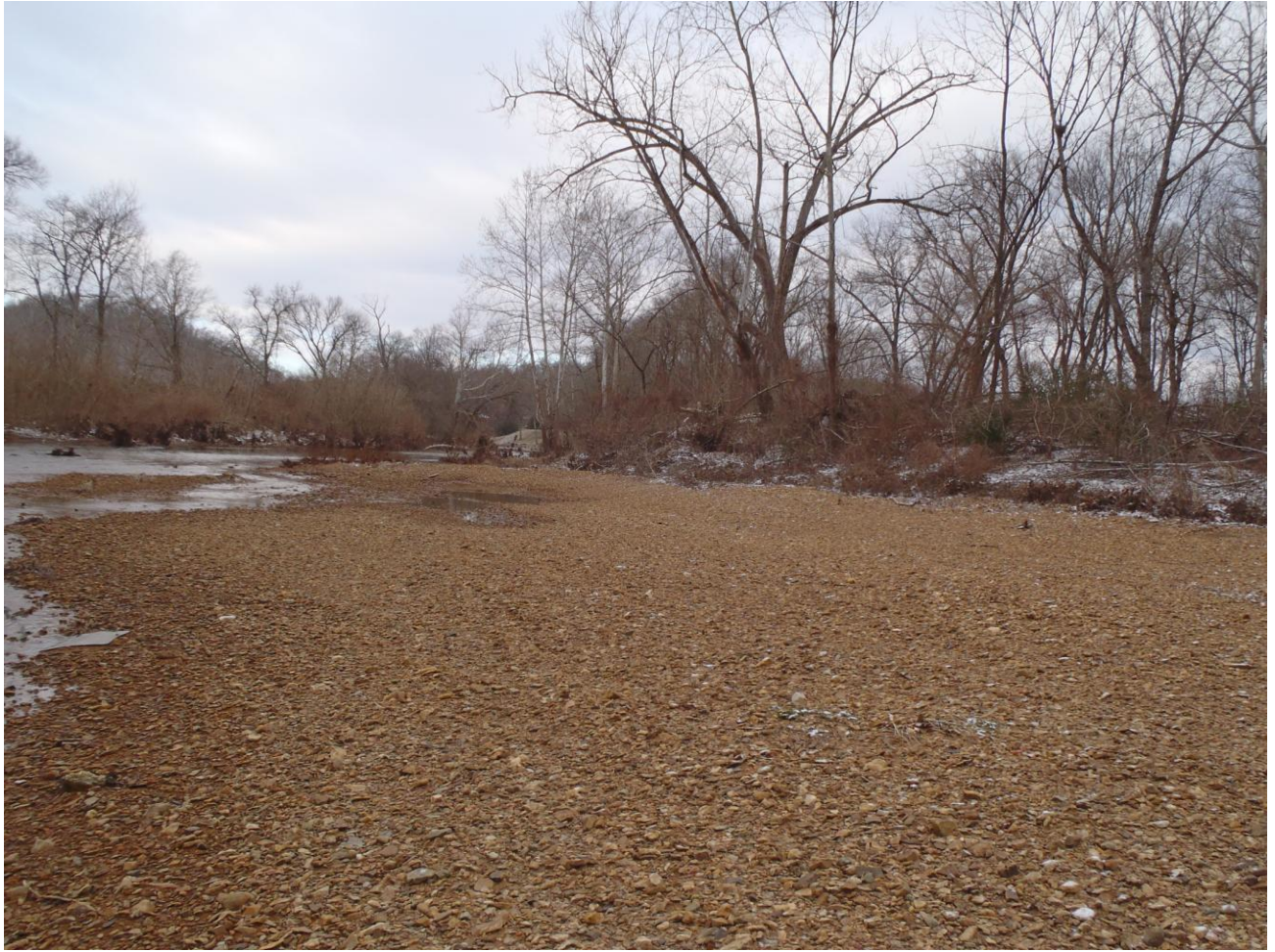
Upstream view of gravel bar