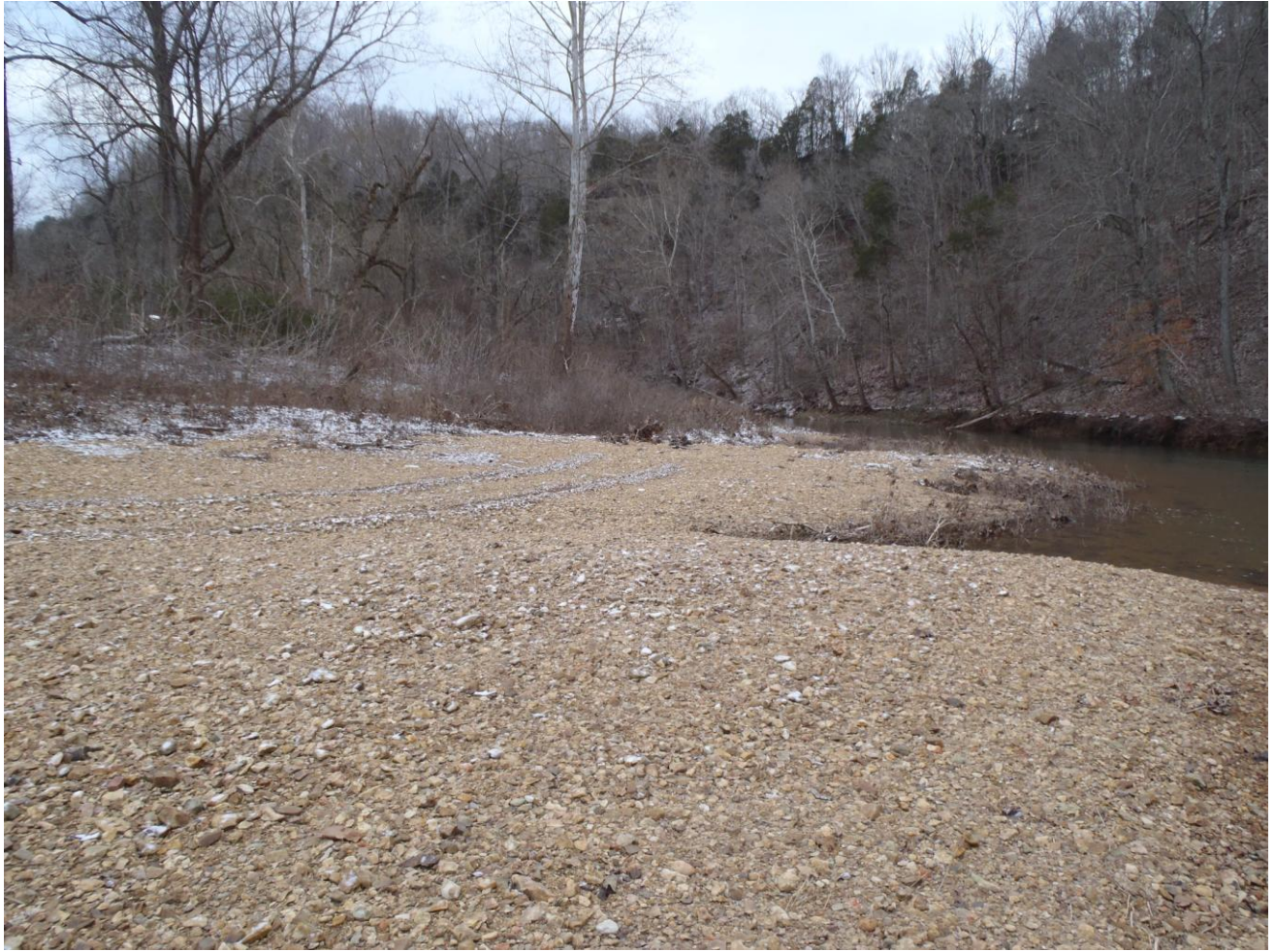
Downstream view of gravel bar