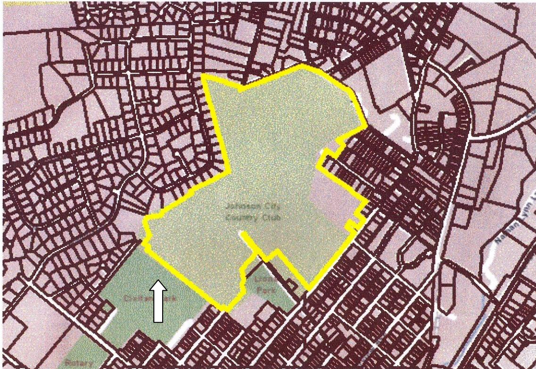
Figure 2. Tax map

Section number figures Page 39 Johnson City County Club Washington County Tennessee