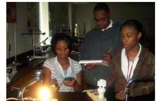
Freshman Watt Busters use meters to evaluate energy efficiency of light bulbs during surveys of their building.