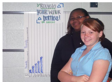
Beta Club collects and graphs plastic bottle recycling