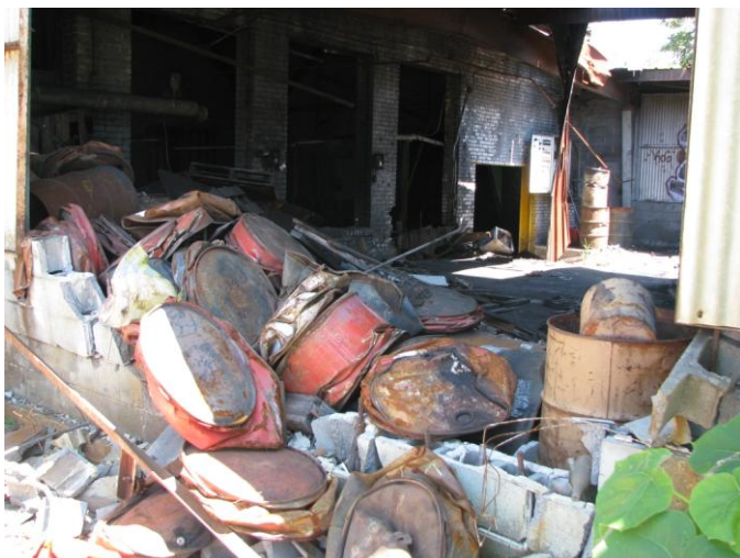
Brownfields can have many unsightly characteristics, such as drums and graffiti as shown in this photo.

The Phase II site assessment is designed to evaluate the degree of contamination and health or environmental risk posed by exposure to such contamination. It may not provide sufficient information to estimate the exact quantity of wastes to be addressed or the costs of cleanup. Additional work may be needed which is discussed in Step 3, "Cleaning up your Site."