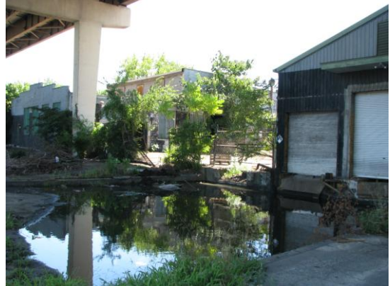
Sometimes Brownfields sites can also have public health and safety hazards.

If contamination is confirmed and the levels of contaminants are known, an assessment of risks to human health and the environment may be conducted to determine how people and/or the environment could be affected. Once a risk assessment has been conducted or a comparison is made to state or federal cleanup standards, a decision can be made regarding whether or not the property poses an unacceptable environmental or health risk. If unacceptable risk is determined to exist at the site, a plan can be developed to clean up the property and reduce risks to humans and the environment