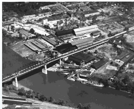
Finding out the history of an area is an important part of a Phase I Assessment. This is a photo of the downtown Nashville Riverfront in 1947.

No. Information from older Phase I reports may be used as a resource, but the 2002 Federal Brownfields Act requires that a Phase I assessment used to meet the requirements of AAI must be completed within a year prior to taking ownership of the property. This is to ensure that the current environmental status of the property is known at the time the property is transferred. In addition, certain aspects of the AAI assessment must be completed within 180 days prior to the property transfer (i.e., on-site investigation, records search, interviews, and search for environmental cleanup liens). This protects the buyer from inadvertently accepting liability for contamination that may have occurred between the time the initial assessment was conducted and when the property actually transfers.