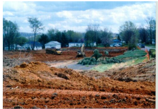
This is a former land fill that was capped by the city of Johnson City for a state of the art soccer complex.

The results of your Phase II assessment may indicate that contamination on the property exceeds state and/or federal screening or cleanup standards. Cleanup may be necessary to either prevent exposure by future users of the site to contamination or to stop a release of contamination into the environment. This Step is intended to provide general information on cleanup and its role in the Brownfields redevelopment process.