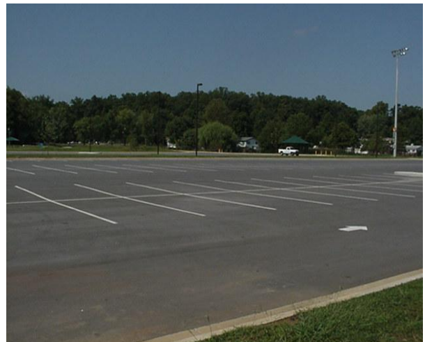
An end use for a Brownfield could be a parking lot, where the parking lot is used as a cap.

What constitutes a successful and protective cleanup has evolved over the past several decades from an expensive “remove it all”