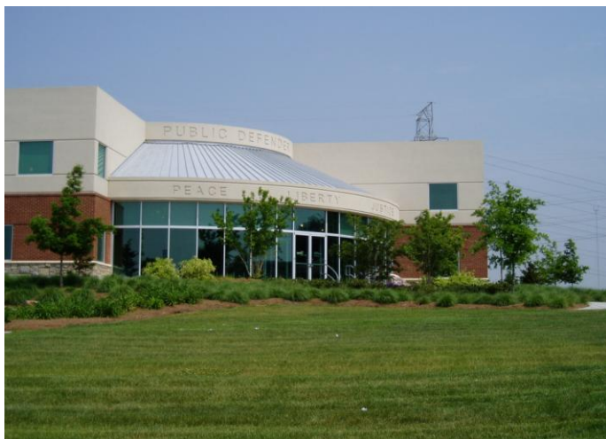
The Peace and Justice Center is home to the Public Defenders office in Knoxville, TN. It is located on a portion of the former Foote Mineral facility.

Alternatively, you may have decided not to clean up the property yourself, but instead to market it for simultaneous cleanup and redevelopment. This is most likely to be successful when contamination at the property has been quantified and final cleanup costs can be determined with certainty.