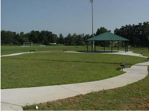
A former landfill was converted to a park and soccer complex.

The type of cleanup required at a Brownfields site depends on a number of factors. These factors include location, type and amount of contaminant(s) present, how widespread and deep the contamination is and the intended future use.