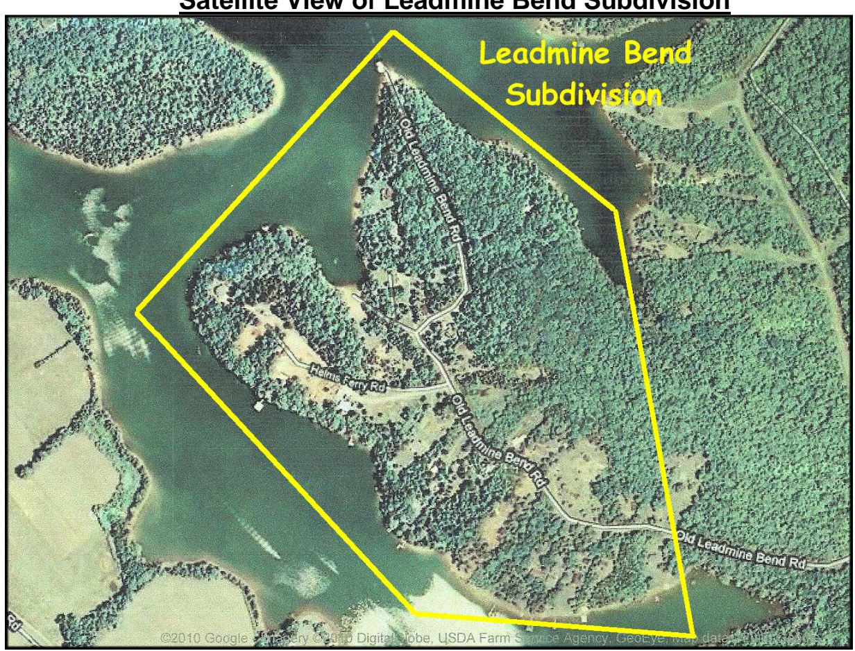
End of Helms Ferry Road

Satellite View of Leadmine Bend Subdivision