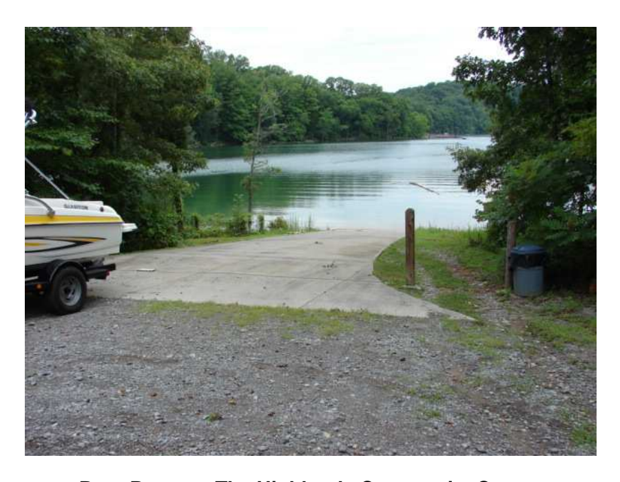
Boat Ramp at The Highlands Community Center