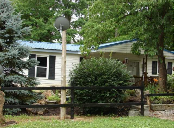
Older Construction with Vinyl Siding and Metal Roofs