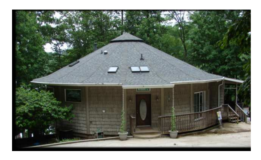
Newer Construction with Vinyl Siding and Asphalt Shingle Roof