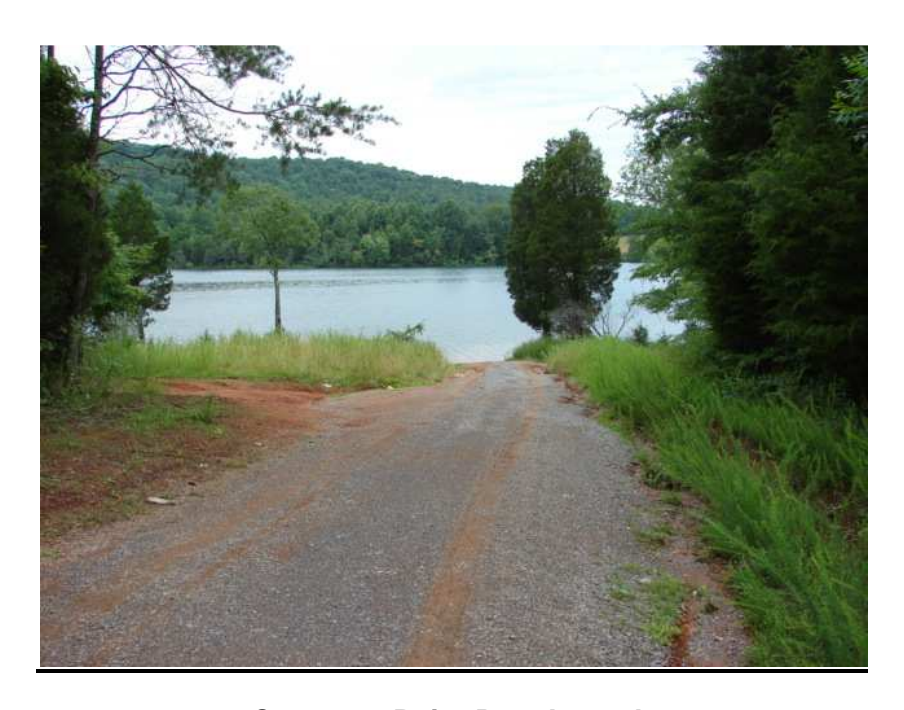
Cemetery Point Boat Launch