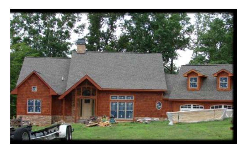
New Construction with Wood Siding and Asphalt Shingle Roof