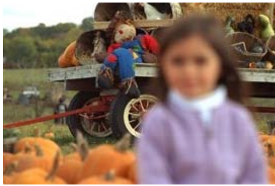
Subject not in focus