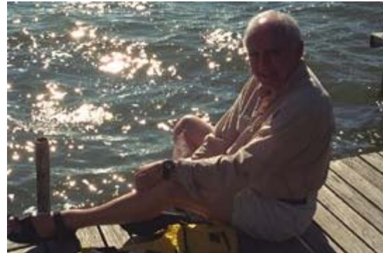
Subject is dark

On cloudy days, use the camera's fill-flash mode if it has one. The flash will brighten up people's faces and make them stand out. Also take a picture without the flash, because the soft light of overcast days sometimes gives quite pleasing results by itself.