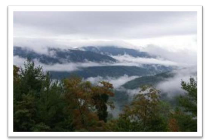
Emory River Forest Legacy Tract

than 30,000 Tennesseans. We also closed on the Fiery Gizzard Conservation Easement on 3,282 acres that helps protect the Fiery Gizzard Trail which was called one of the top 25 hiking trails in the United States by Backpacker magazine. Other Legacy projects during the review period included securing conservation easement on Carter Mountain Working Forest-4,000 acres, Sherwood Forest fee Purchase- 4,315 acres, Devil's Racetrack -1,928 acres, and Grassy Cove - 1,000 acres.